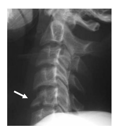
Case 2: 19-year-old male presents with diffuse paraesthesia following injury.

This series of X-rays demonstrate the dislocated facet distracting, perching and finally reducing into its normal place. Following reduction, an anterior C5/6 fusion was performed with a plate and iliac crest bone graft. This allowed discharge within a few days. An intra-operative open reduction and fusion would also be an acceptable option.